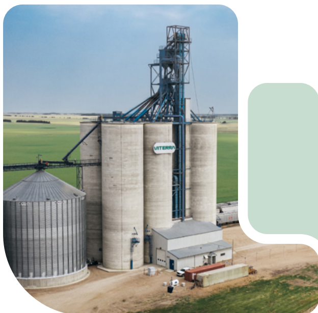
Valparaiso storage and handling facility, Saskatchewan, Canada

In 2021, we finalised our investment in Wings Agro – a pulse processing joint venture situated in Rajkot, India. The investment builds on our existing presence in the Indian pulse market and provides us with increased insights into the downstream supply chain.